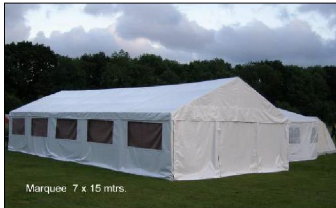
Marquee 7 x 15 mtrs.