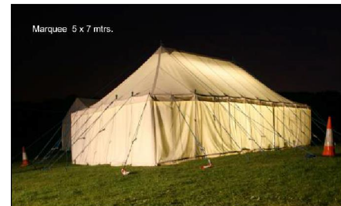
Marquee 5 x 7 mtrs.